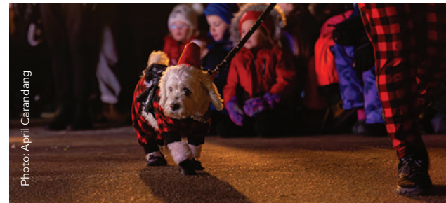
Matchy-matchy owners and pets impress the crowds at the annual Pooch Parade.

Increase in traffic: 60% for local gallery 50% for local pub