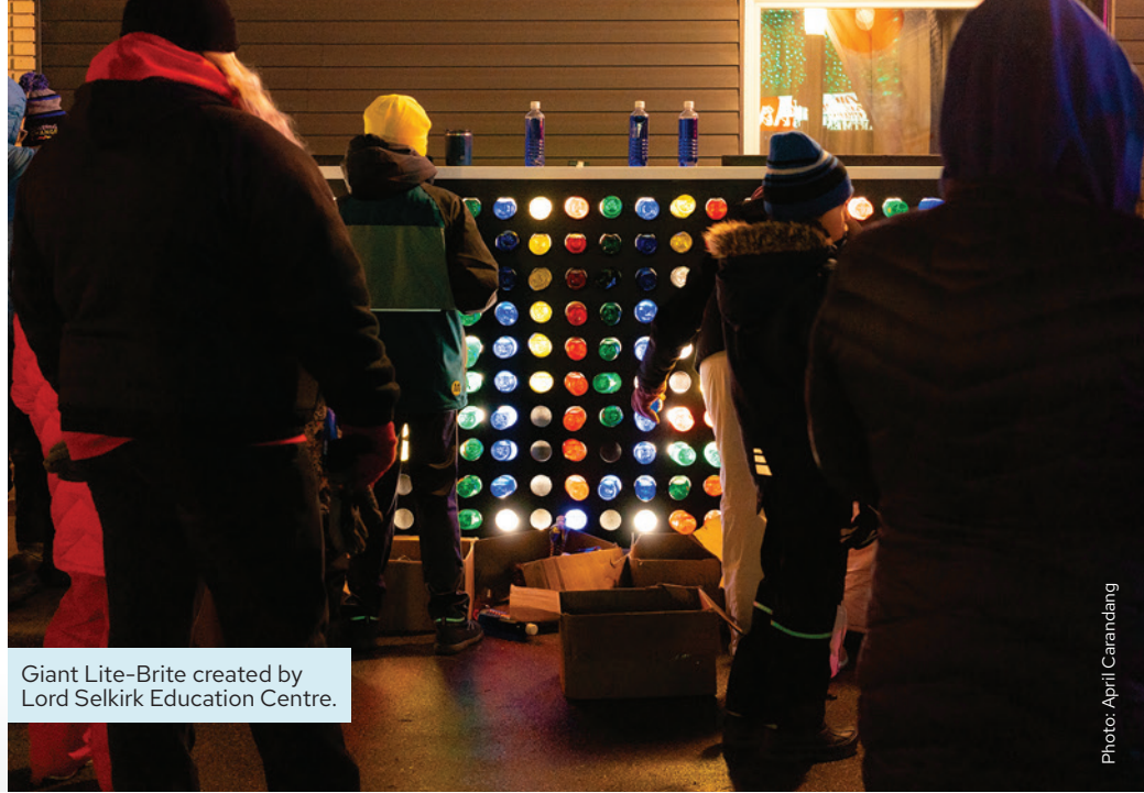
Giant Lite-Brite created by Lord Selkirk Education Centre.

Every year Holiday Alley partners with amazing educators at Lord Selkirk School Division. This year they made it possible for students to learn, share, create and build. These students are Holiday Alley's future. Thank you LSSD and your staff!