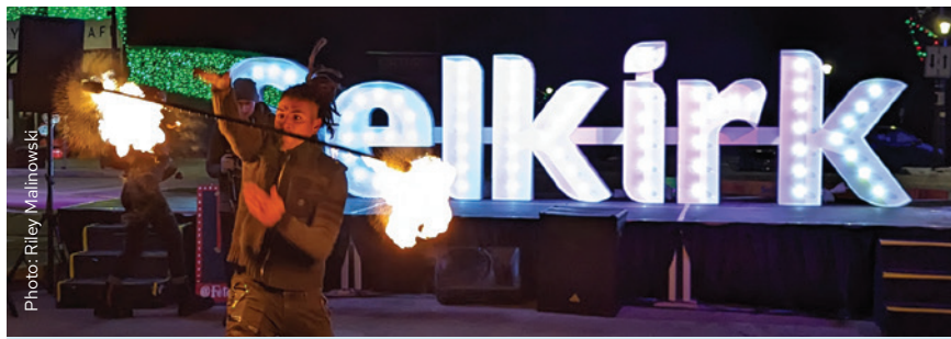
Holiday Alley lights up with flaming talent and the new Selkirk sign.