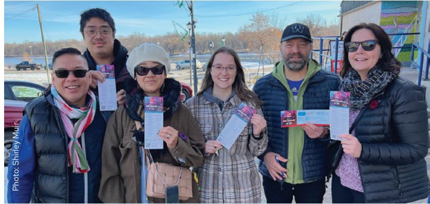
Grabbing your Soup Cook-Off tickets and hitting the soup trail is a must-do outing.